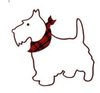
PEACE, GRACE AND LOVE TO ALL...

May the saddest day of your future Be no worse than the happiest day of your past.