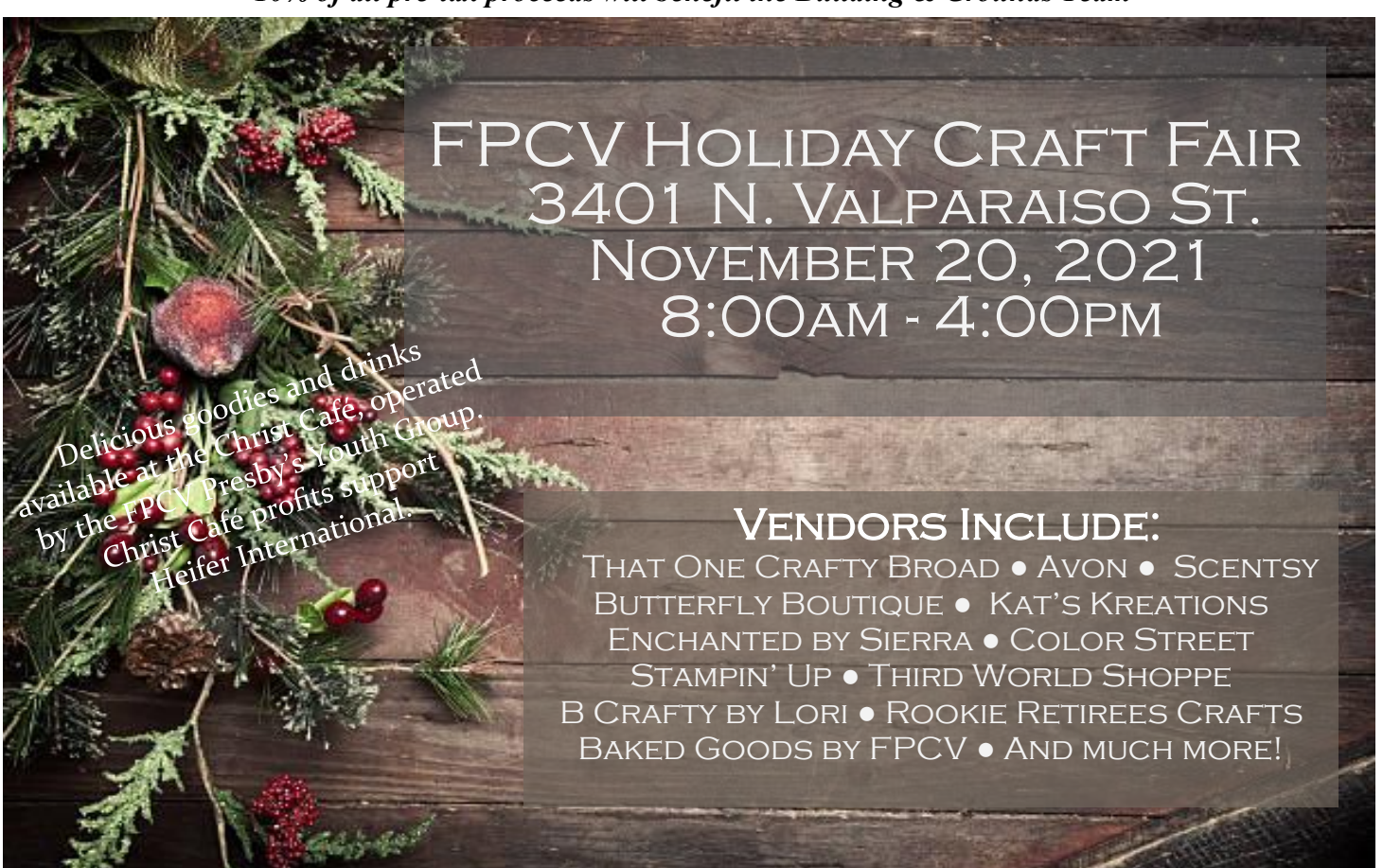
10% of all pre-tax proceeds will benefit the Building & Grounds Team

Shoe's Pizzeria 3300 Calumet Ave Valparaiso, In 46383 (219) 476-7463